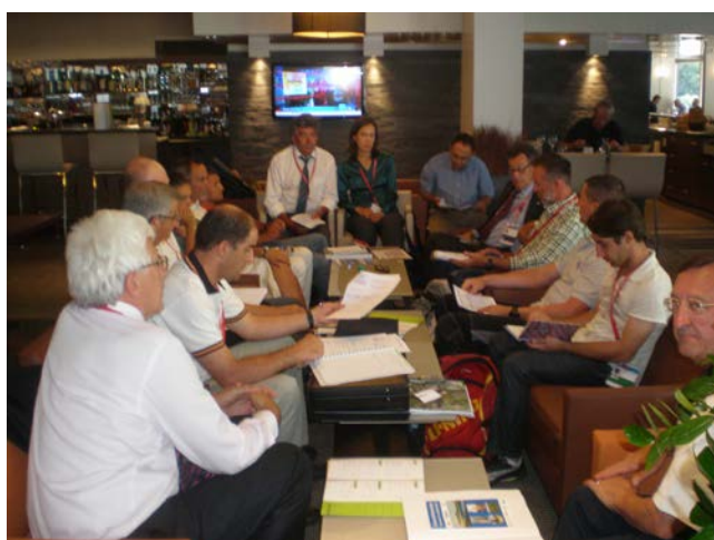
2nd Council Meeting of the COMOF, celebrated in Chambéry (France).

Additionally to the member countries, new countries (Bulgaria, Cyprus, France and Croatia) were invited to join the Assembly.