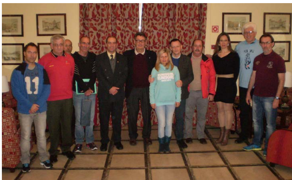
Family photo during the 7th meeting of the COMOF Executive Council