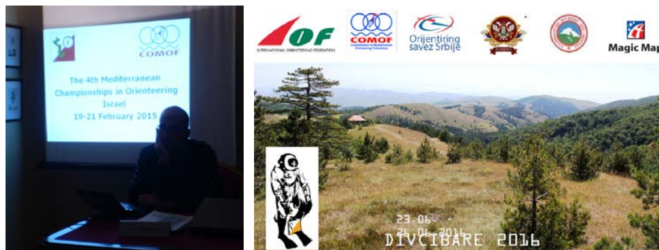
Israel and Serbia presented their competitions for 2015 and 2016

Israel and Serbia presented the next two editions that will be in 2015 in Israel and 2016 in Serbia.