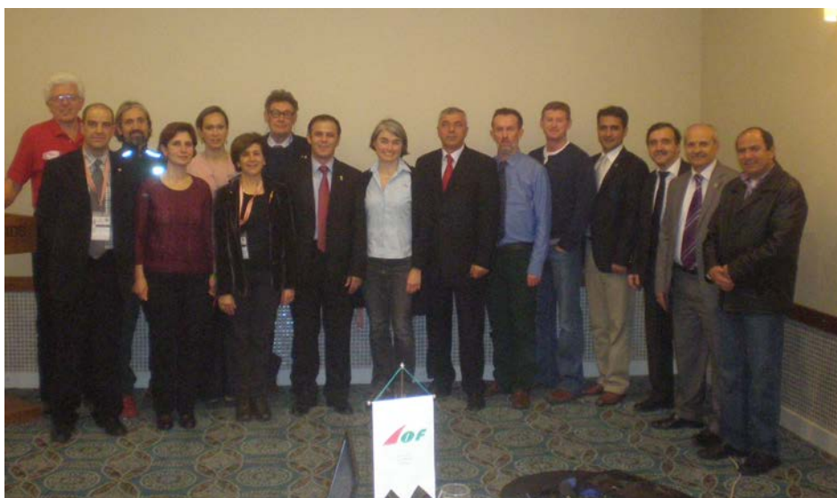
Family Photo of the 5th COMOF Executive Commission