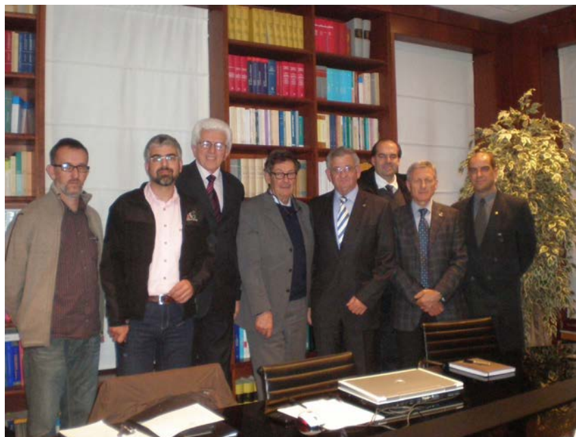
At the lawyers's : photo of family: November 13th, 2010.