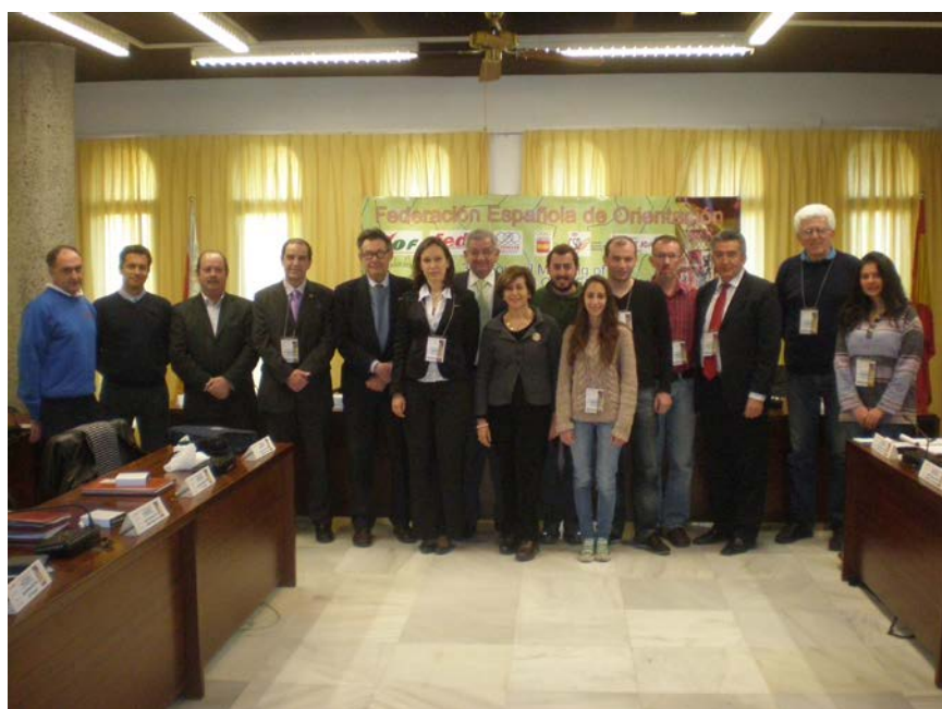
3rd Council meeting of the COMOF celebrated in San Joan d'Alacant (Spain).