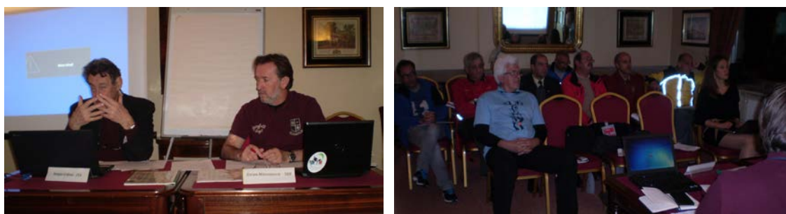
Moments of the meeting of the Executive Commission of the COMOF